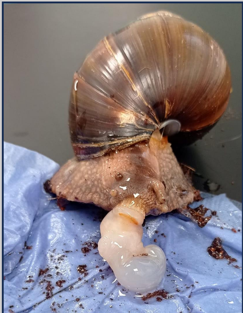
Figure 1. A large prolapse was present upon presentation. Presumed to be originating from the digestive tract it was identified as the crop.

The popularity of invertebrates as household pets has risen in the past decade (Battiston, et al , 2022). It can be speculated that these animals may