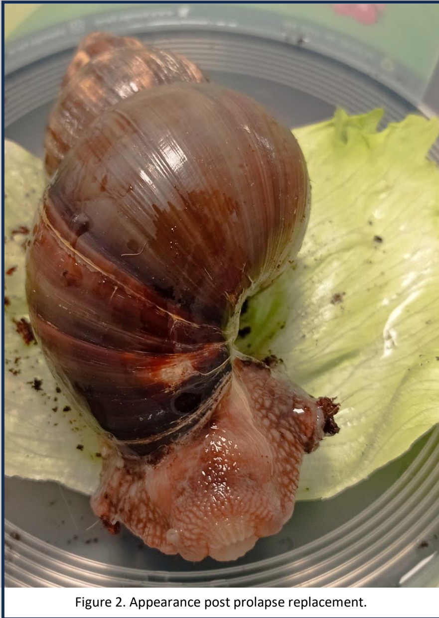
Figure 2. Appearance post prolapse replacement.

provide an attractive, alternative option to more traditional pets such as dogs and cats and often require less time of their owner. The cost of initial purchase and ongoing care is generally lower; in the current economic climate this is likely to be desirable (Osborne and Doherty, 2021). African Giant Land Snails (AGLS) appear to be one of the most kept invertebrates; true numbers are unknown, but multiple husbandry sheet recommendations can easily be found (RSPCA, no date; RVC 2022).