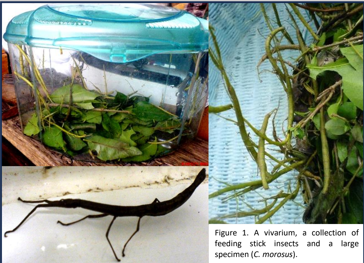
Figure 1. A vivarium, a collection of feeding stick insects and a large specimen ( C. morosus ).

Stick insects are elongated and cylindrical with biting mouthparts. In the winged species, the forewings are small and bark-like, while the hindwings are folded into a fan. In addition to their cryptic colouration, they may resemble stumps of broken twigs or thorns, respectively. They can remain motionless for long periods, with their forelegs extended anteriorly. If disturbed they feign death or, in the winged species, suddenly spread their wings with a rustling noise.